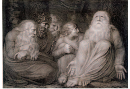
William Blakes painting of Job, his wife and the three friends: Eliphaz, Bildad and Zophar.

Three supposed friends of Job appear on the scene. In spite of all the cruel words they heaped onto the head of Job, he was able to find it in his heart to show a forgiving spirit. Job remembered his friends in his prayers to God. In this way his prayers became medicine for his own soul; bitterness, anger and revenge were excluded by the greater power of forgiveness.